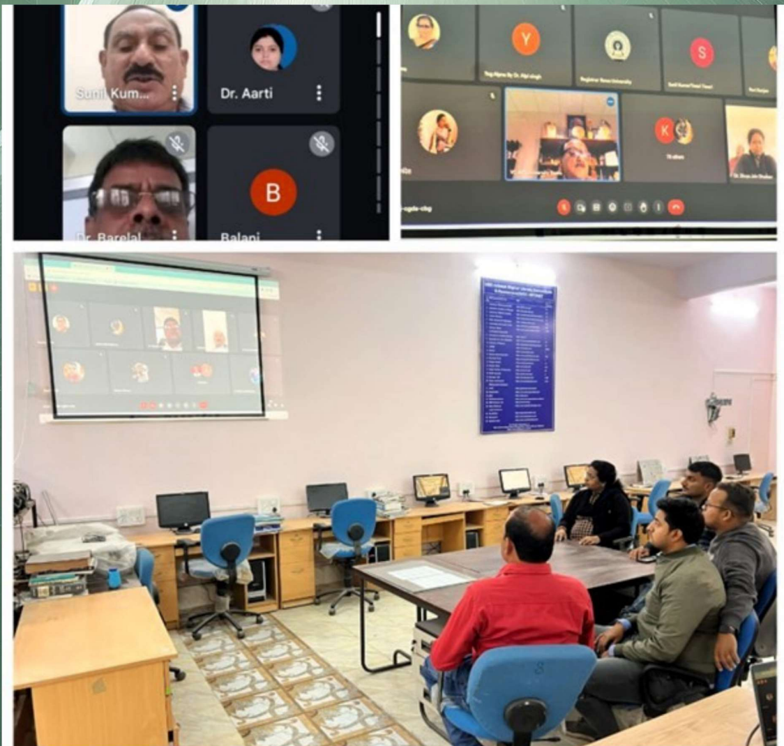
Glimpse of the Event Participant's attending online and offline both the mode