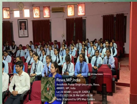
Rewa, MP, India Awadhesh Pratap Singh University, Rewa, 486003, MP, India Lat 24.565881, Long 81.326053 11/03/2023 04:26 PM GMT+05:30 Note - Captured by GPS Map Camera