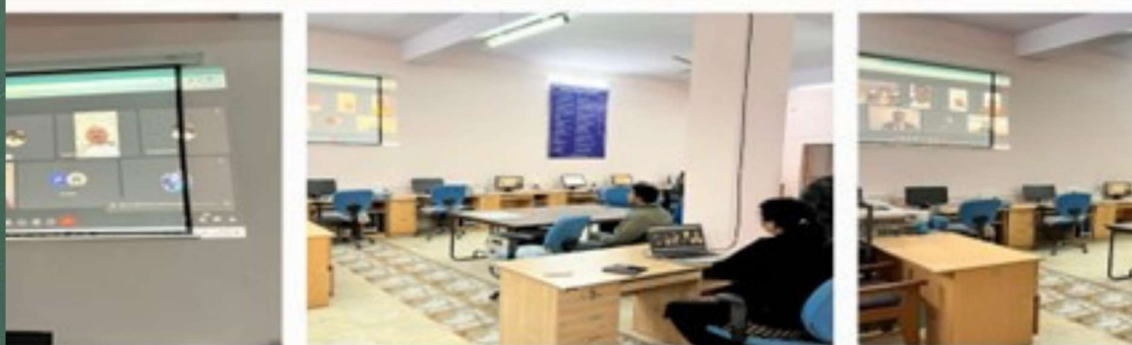
Glimpse of the Event Webinar Participant's attending online