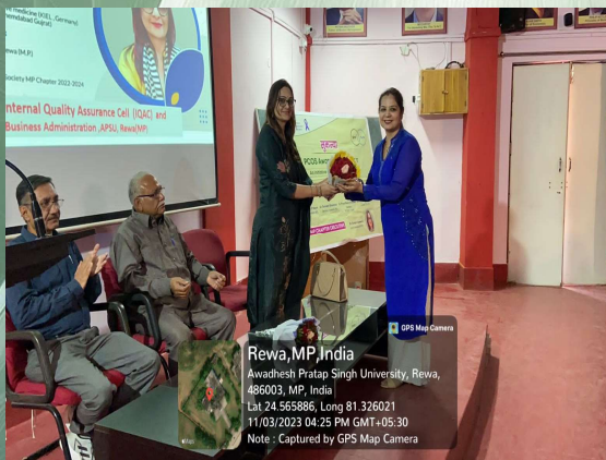
Rewa, MP, India Awadhesh Pratap Singh University, Rewa, 486003, MP, India Lat 24.565886, Long 81.326021 11/03/2023 04:25 PM GMT+05:30 Note - Captured by GPS Map Camera